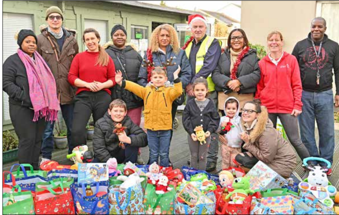
Kind & Co donations